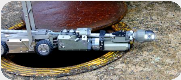
Lateral Launch System M150 LL

... consisting of L135, PM135, SKM135, ZKM & Lateral Camera KS60CL